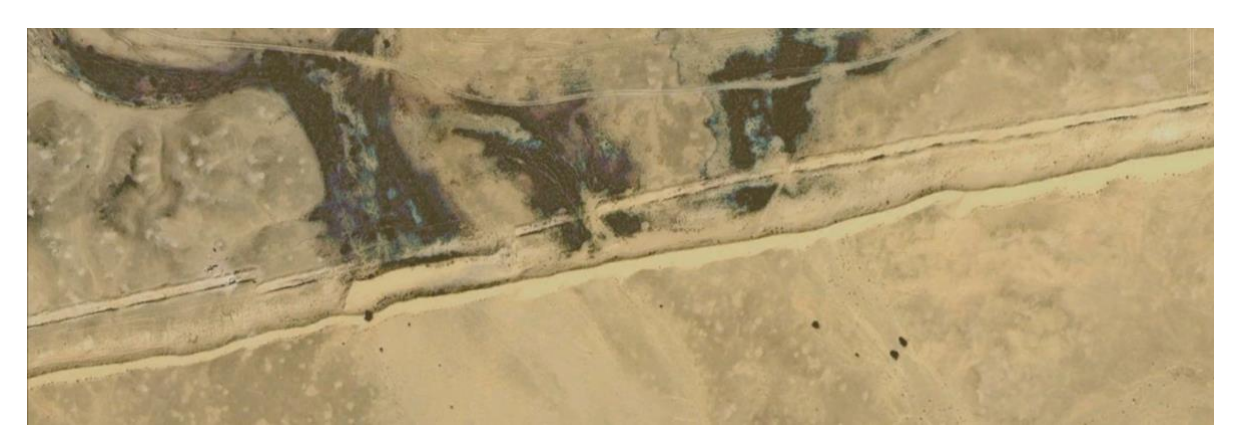
Figure 3. Drainage channels blocked by the Moroccan Berm, located some 20 km south-southwest of Oum Dreyga, at 23.9440 N; 13.3456 W. One of many such examples along the Berm.

Rainfall is projected to decrease over the western Sahel region, covering Mauritania, western Mali, and southern Western Sahara, while droughts are expected to become more prevalent and severe. The impacts of any reduction in rainfall will be amplified by higher average, minimum and maximum temperatures, and more severe heat extremes, which increase evaporation and therefore reduce surface runoff, soil moisture, and groundwater recharge rates and levels. Droughts will be particularly severe when they coincide with episodes of extreme heat, due to higher evaporation rates. At the same time, higher temperatures and heat extremes increase water demand for domestic consumption, livestock, and agriculture. The higher temperatures of the Saharan interior, and the greater projected warming in the Liberated Territories and the area hosting the camps mean that these impacts — and their secondary impacts on food production and food and water security - will be more pronounced for the displaced Sahrawi population and those living in the area under SADR control.